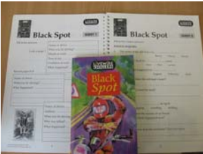
Teacher's Book used in conjunction with reader

The Livewire Series, published by Hodder & Stoughton in association with the Basic Skills Agency, have produced a large library of basic reading material that is well presented and interesting to read. Most of our students will be familiar with these readers, especially the Real Lives series covering such titles as 'Manchester United', but what is not so well known is that these readers are accompanied by a large collection of photocopyable worksheets in a corresponding set of Teacher's Books. Each Teacher's Book offers additional extension activities for